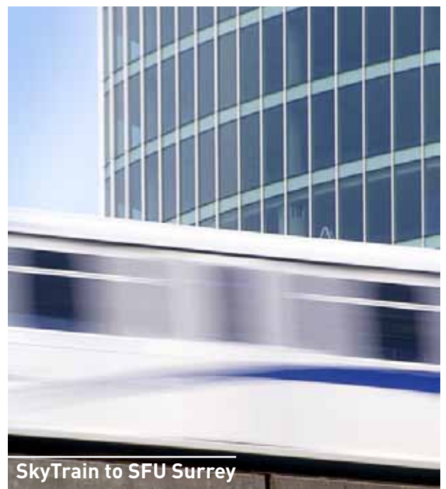
SkyTrain to SFU Surrey