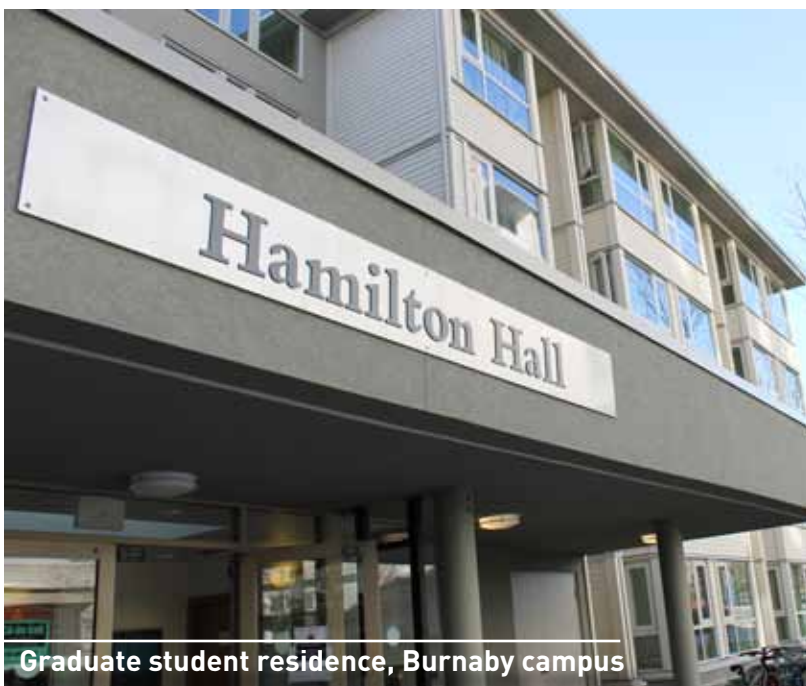
Graduate student residence, Burnaby campus

If you will be conducting your studies outside Metro Vancouver, please consult the U-Pass BC website on how to make yourself ineligible, as you will be charged $30 per month otherwise. See http://students.sfu.ca/upass/eligibility.html .