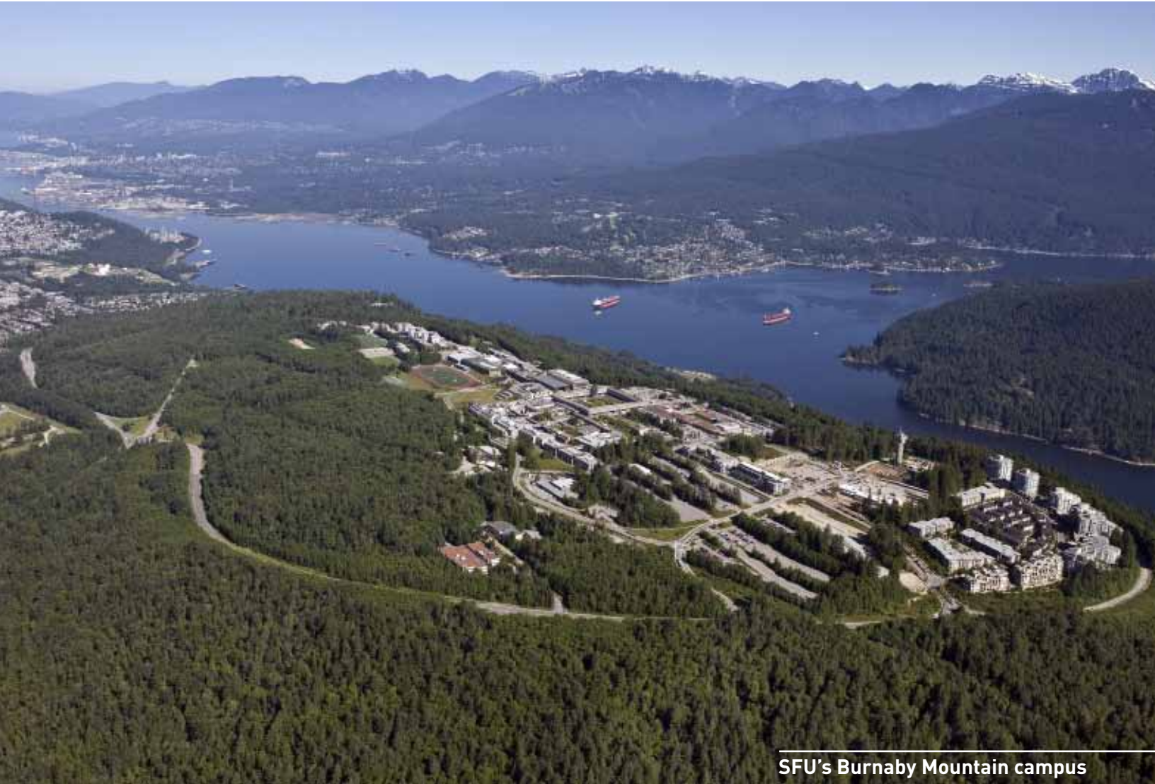
SFU's Burnaby Mountain campus

SIMON FRASER UNIVERSITY DEAN OF GRADUATE STUDIES