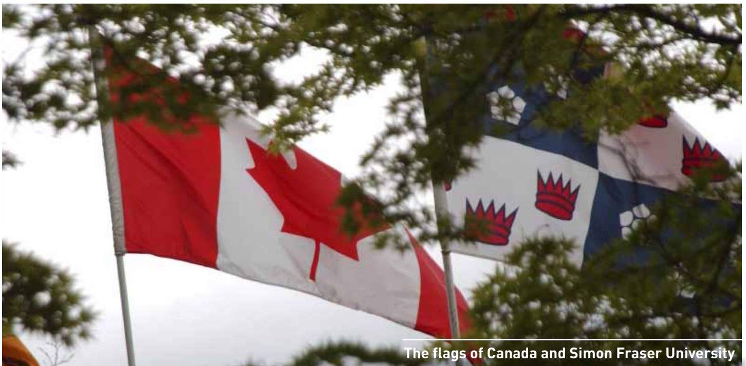
The flags of Canada and Simon Fraser University

Should the academic program requirements change during your degree, those requirements which are most beneficial to you will apply. In these cases, please consult with your graduate program chair.